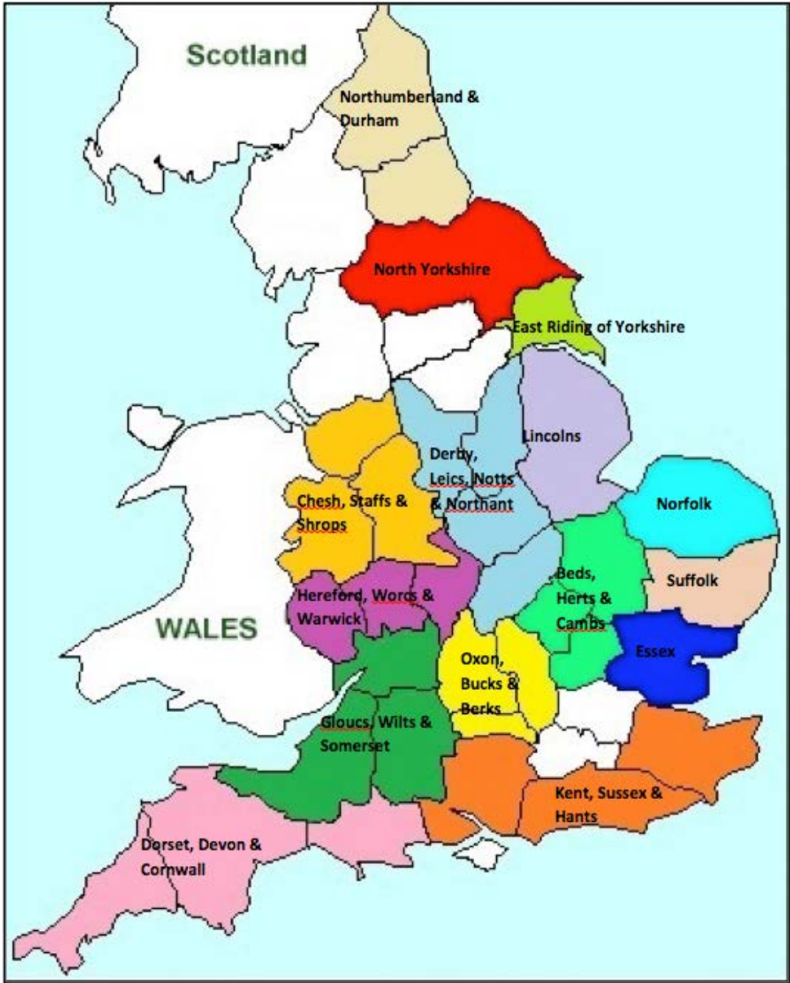
Fig 2. Amalgamation of counties